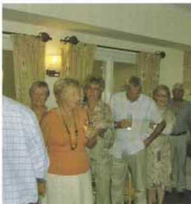
Golf Prize Giving Cocktail at QDLCC October 2009

This Season Gold Competition "Winners" (Handicap / Points):